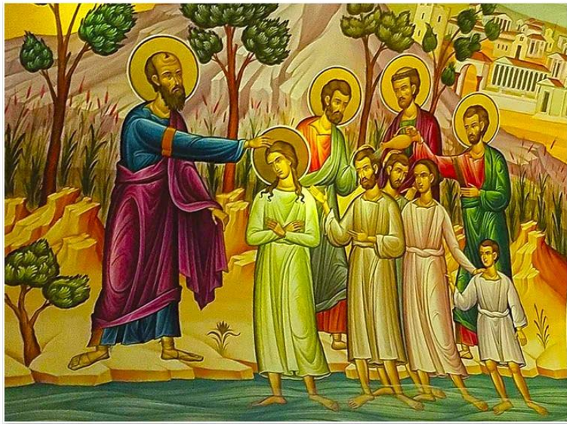
St. Paul baptizing St. Lydia and her family - as seen in the Holy Baptistry of St. Lydia Kavala (Greece)

to stay and used her gifts of hospitality to welcome them to her community. How is God calling you to use your gifts to share the Gospel?