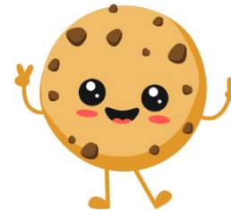
Cookies for Kenwood